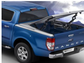
Tonneau Cover Hard 1 piece (silver)