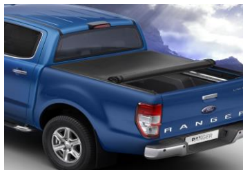
Tonneau Cover Soft