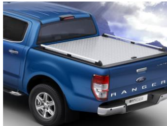
Tonneau Cover Aluminium 1 piece with tie-down rails 1