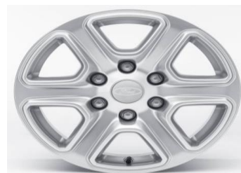
17" Silver Alloy Wheels