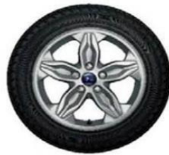
16" 5 Spoke Premium Silver Alloy