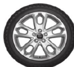
17" 10 Spoke Alloy