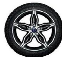
17" 5 Spoke Black Alloy