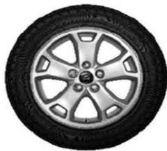
16" 5 Spoke Alloy