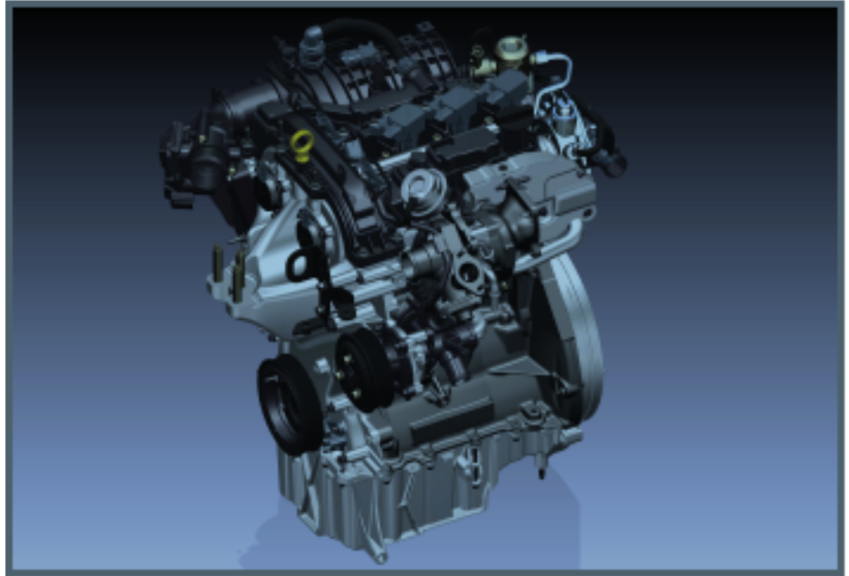
125PS FOCUS 1.0-LITRE ECOBOOST

integrated exhaust manifold into the cylinder head to lower the temperature of exhaust gases and warm up the engine faster, even at cold starts.