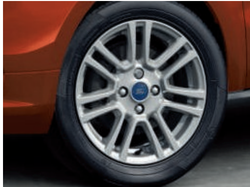
16" 7-spoke silver alloy wheels (Standard)