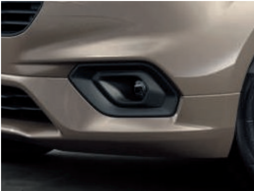
Front fog lights (Standard)

9 Note: A rear-facing child seat should never be placed in the front passenger seat when the Ford vehicle is equipped with an operational front passenger's airbag. The safest place for children is properly restrained on the rear seat.