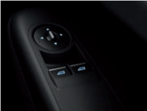
One touch up/down electrically-operated driver's and front passenger's windows (Standard)