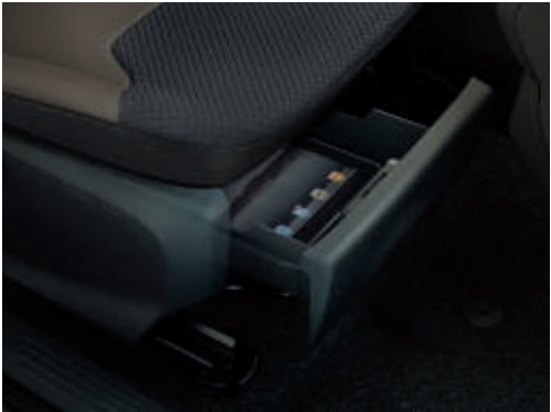
Passenger's side underseat stowage drawer (Standard)

9 Note: A rear-facing child seat should never be placed in the front passenger seat when the Ford vehicle is equipped with an operational front passenger's airbag. The safest place for children is properly restrained on the rear seat.