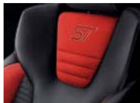
Protection in Lux in Charcoal Black insert, Lux Soft in Race Red bolster (ST-2 in Race Red)