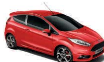
Race Red Standard body colour