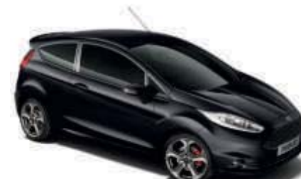
Shadow Black Premium body colour 1