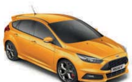
Tangerine Scream** Exclusive body colour 1