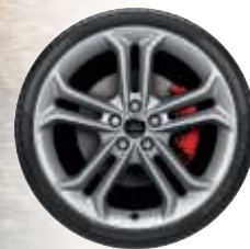
19" Silver alloy wheel. (ST Style Pack)