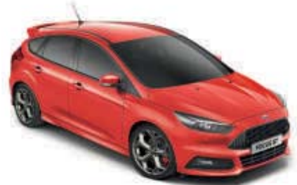
Race Red Standard body colour