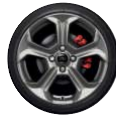
17" 5-spoke Rock Metallic painted alloy wheel (as part of ST Style Pack)