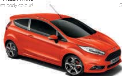
Molten Orange* Exclusive body colour 1