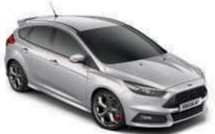
Moondust Silver Premium body colour 1