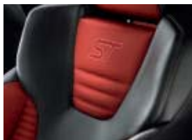
Protection in Molten Orange insert, Torino leather in Charcoal Black/Lux Soft in Molten Orange bolster (ST-2 & ST-3 in Frozen White, Shadow Black and Molten Orange)