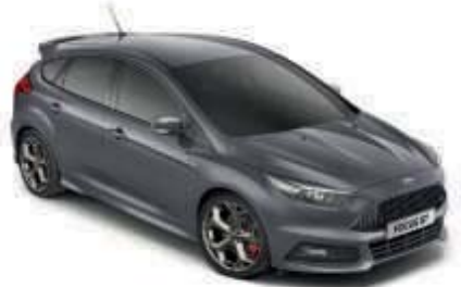
Stealth** Standard body colour