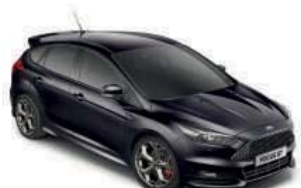
Shadow Black Premium body colour 1