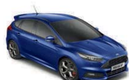
Deep Impact Blue Premium body colour 1