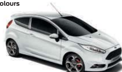
Frozen White Premium body colour 1