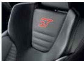
Protection in Smoke Storm insert, Torino leather in Charcoal Black/Lux Soft in Smoke Storm bolster (ST-2 & ST-3)