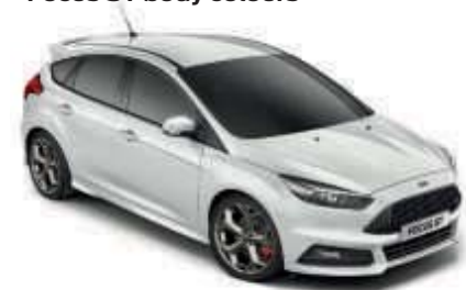
Frozen White Premium body colour 1