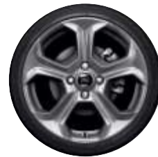
17" Flash Grey alloy wheel. (Standard)