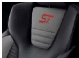
Protection in Lux in Charcoal Black insert, Lux Soft in Smoke Storm bolster (ST-2 in Frozen White, Shadow Black or Moondust Silver)