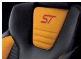
Protection in Lux in Charcoal Black insert, Lux Soft in Tangerine Scream bolster (ST-2 in Tangerine Scream)