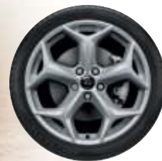
18" Flash Grey alloy wheel. (Standard ST-2 calipers)