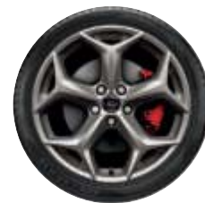
18" Rock Metallic alloy wheel (standard on ST-3)