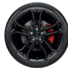
19" Black alloy wheel. (ST Black Style Pack)