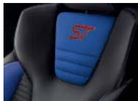
Protection in Lux in Charcoal Black insert, Lux Soft in Spirit Blue bolster (ST-2 in Deep Impact Blue)