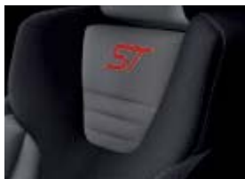
Airfield in Silverstone Grey insert, Lux Soft in Charcoal Black bolster (ST-1)