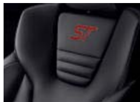
Windsor leather in Charcoal Black insert and bolster (ST-3)