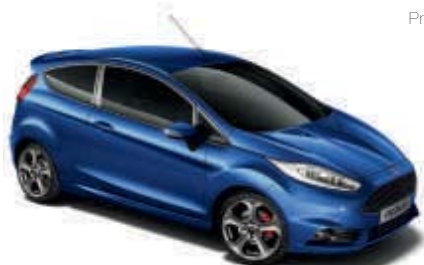
Spirit Blue* Premium body colour 1