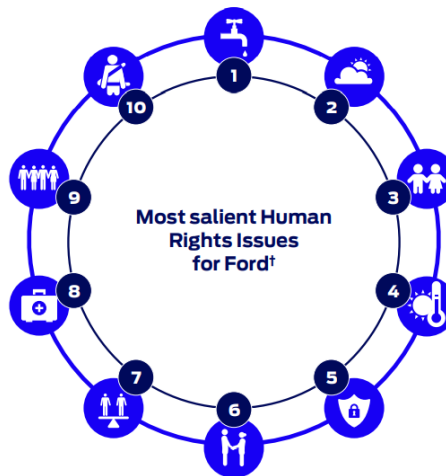
Our Salient Human Rights Issues

In 2022, we performed our third human rights saliency assessment to identify Ford Motor Company’s salient issues. Conducted in line with the UN Guiding Principles Reporting Framework (UNGPRF), the saliency assessment identified and updated the human rights issues at risk of the most severe negative impacts through our activities and business relationships. In conducting the assessment, we consulted with global external subject matter experts in human rights, environment, and labor relations. The assessment identified 10 salient human rights issues, including child labor, forced labor and ethical recruitment, human trafficking, and equal and fair wages (see graphic). These apply throughout our business and extend to our partners and supply chain.